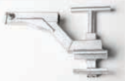
LSS-0060 RAFTER CLAMP