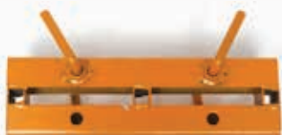
LSS-0055 RAIL GATE SLIDER