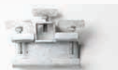
LSS-0011 MULTI CLAMP