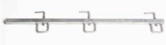
LSS-0005 SHORT POST