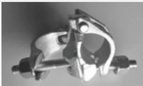
LSS-0041 RIGHT ANGLED COUPLER