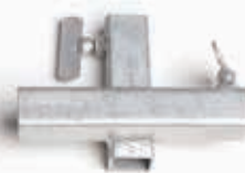
LSS-0034 LARGE CROSS OVER