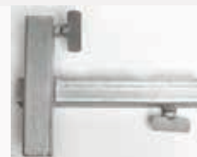
LSS-0035 EXTENDED CROSS OVER