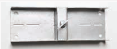
LSS-0004 ROOF BOOT