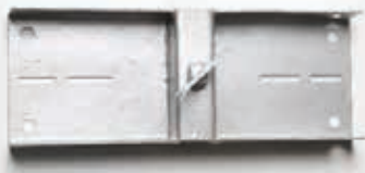
LSS-0004 ROOF BOOT