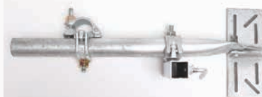
LSS-0040 POLE ROOF BRACKET