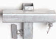
LSS-0034 LARGE CROSS OVER