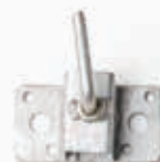
LSS-0030 SHORT SLIDER