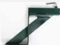
LSS22 SIDE BRACKET