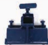
LSS-0013 VERTICAL FLANGE CLAMP