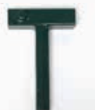
LLS-0031 TEE BRACKET (GREEN)