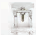
LSS-0016 LARGE G PURLIN CLAMP