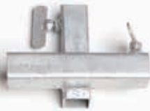
LSS-0034 LARGE CROSS OVER