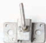
LLS-0030 SHORT SLIDER