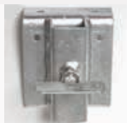
LSS-0045 RIGHT ANGLED BRACKET