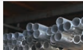
LSS-0042 POLE 4.5M ALUMINIUM