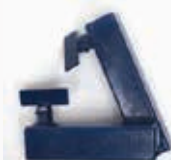
LSS-0037 ANGLED CROSS OVER – 22 DEGREES – BLUE OR YELLOW