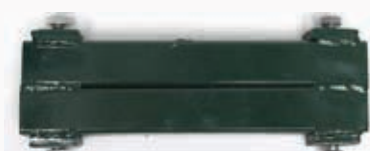
LSS-0010A EXTENSION SIDEXSIDE