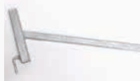
LSS-0063 LARGE POST SUPPORT