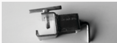
LSS-0009 EXTRA RAIL CLAMP