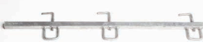
LSS-0005 SHORT POST